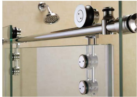
WHEEL ASSEMBLY & TOP BAR TRACK